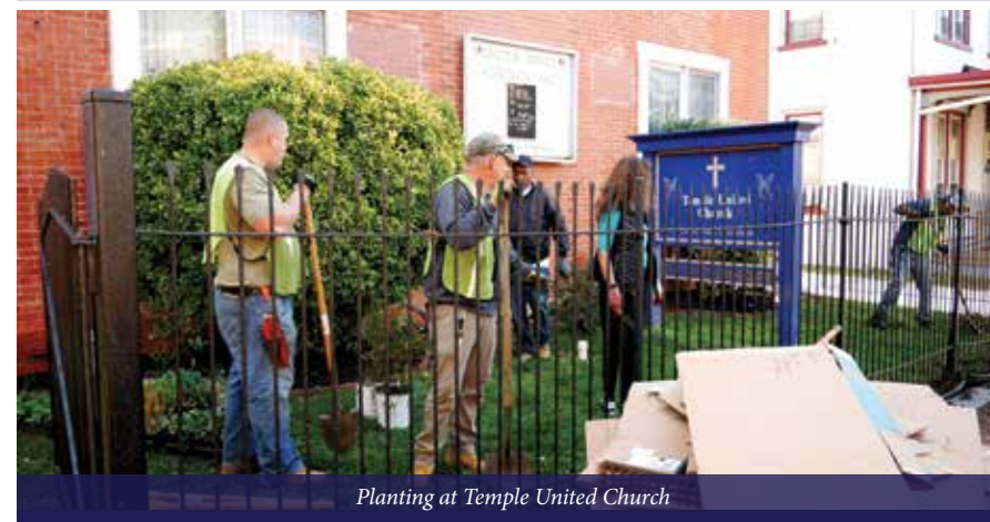
Planting at Temple United Church