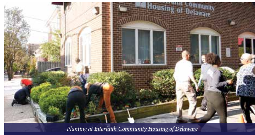
Planting at Interfaith Community Housing of Delaware

This project successfully installed ten new native plantings during this first year in 2022 and has served as a means for involving DCH's new Delaware River Climate Corps (DRCC) with the installation of three of these sites; Interfaith Community Housing of DE, Temple United Church, and Praying Grounds Community Church. The installations provided an opportunity to reinforce classroom instruction with hands-on field work, strengthening the DRCC team's understanding of the need for pollinator habitat, while expanding on topics related to ecological processes as integral to improving climate resiliency. The DRCC will stay involved as the Sacred Grounds™ partnership advances into its second year in 2023, with the goal of engaging ten more organizations that will each install a Sacred Grounds™ pollinator garden.