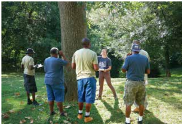
DRCC Team identifying trees during plant identification class.

The Delaware Center for Horticulture is proud to continue its participation in forming the new Delaware River Climate Corps (DRCC), a regional initiative led and supported by the William Penn Foundation, The Corps Network, and important partner organizations throughout the watershed.