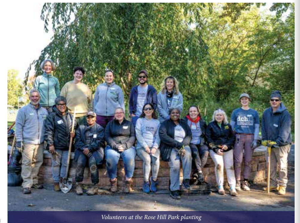
Volunteers at the Rose Hill Park planting

We deeply regret any errors or omissions. Please notify our advancement staff of any corrections at 302-658-6262 or mstephenson@thedch.org.