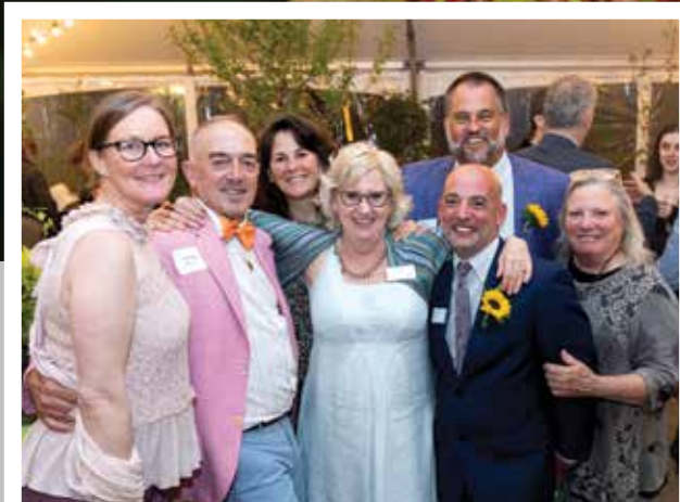
Enjoying the 40th and Final Rare Plant Auction®

Through interactive presentations provided throughout the day, DCH and NCCL leaders instilled the importance of installing native plants into the landscape and to expand upon this message, plants were provided to the NCCL students and Discover volunteers to take home for incorporation into their personal gardens.