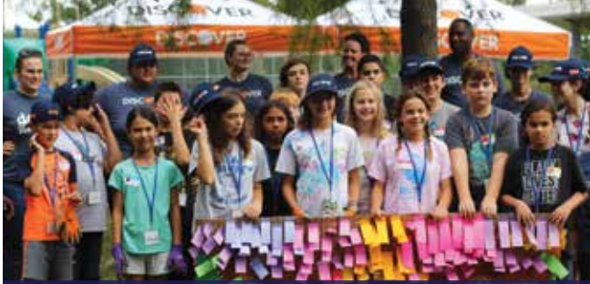
NCCL students and Discover volunteers with the meadow planting plan