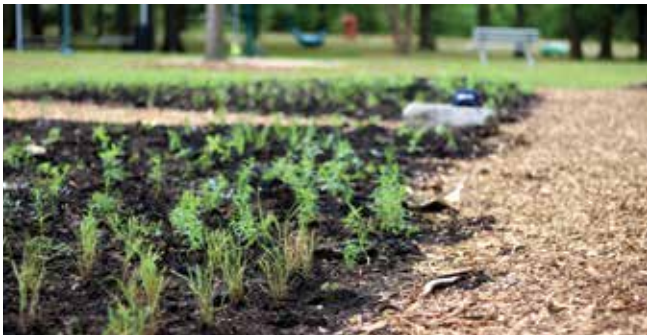
Freshly planted Landscape Plugs™ by NCCL students

In an exciting community project, we partnered with Discover volunteers and the Newark Center for Creative Learning (NCCL) to plant a native meadow garden at Phillips Park in Newark, DE, adjacent to the NCCL school. The site was first prepared by NCCL students, their parents, and the Newark City Parks Department by removing invasive plants in July. A few short months later, DCH staff and volunteers from Discover paired with NCCL students from K-8th grade to guide the installation of over 1,500 Landscape Plugs™, supplied by North Creek Nurseries, Inc.